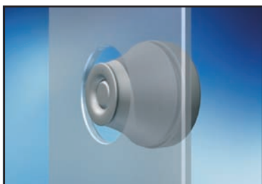
Push the grommet into the hole.