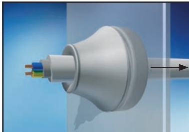
The grommet is the locked in position by pulling it back about a centimetre.