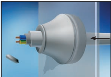
Pierce the grommet with the cable.