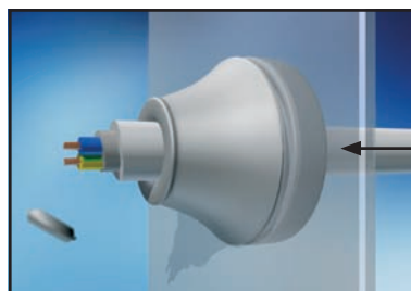
Pierce the grommet with the cable.